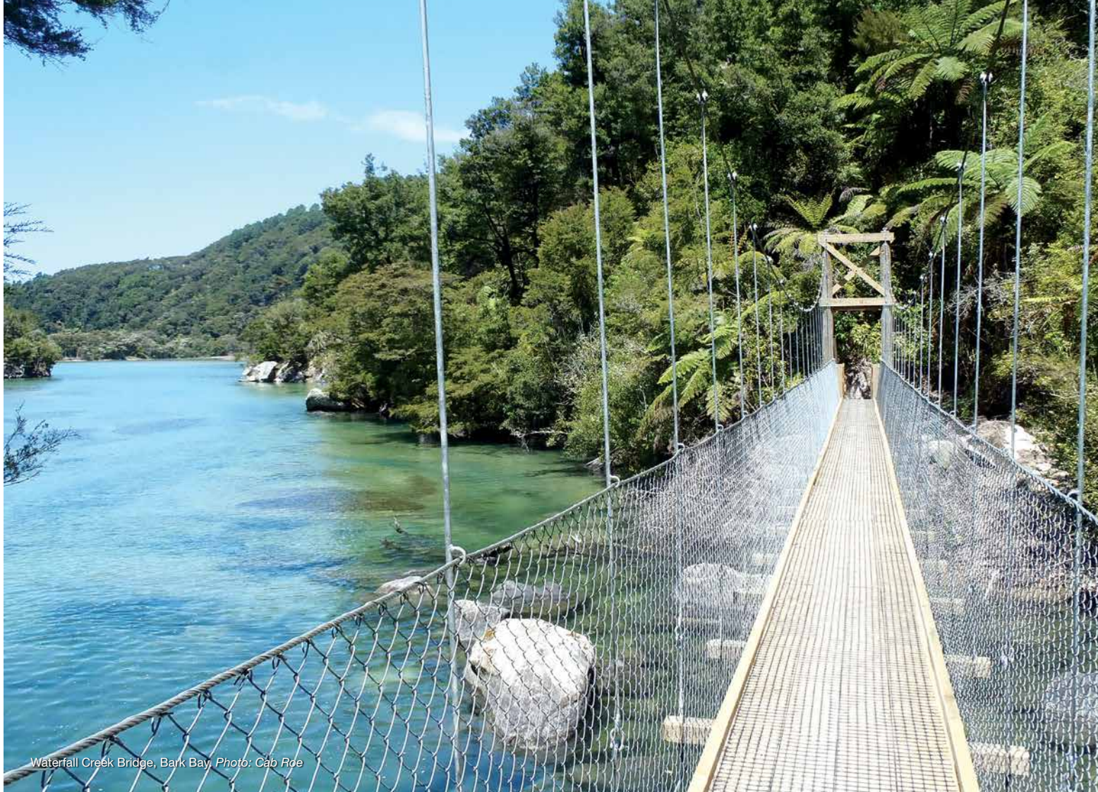
Waterfall Creek Bridge, Bark Bay.