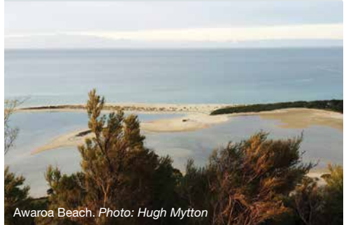
Awaroa Beach.

Awaroa Beach is famous in New Zealand. It was bought in 2016 through a crowd-funding campaign to enable it to become public national park land.