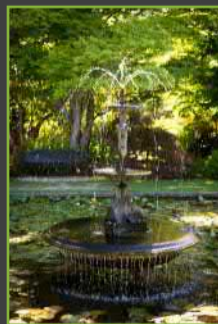
Falconer Fountain, Coalbrookdale Foundry, c.1875.

Kitset garden decorations like the Falconer Fountain were popular in the late 1800s. The Peacock Fountain in the Botanic Gardens is from the same foundry.