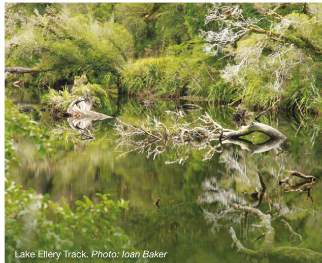
Lake Ellery Track.

Europeans first attempted to settle at Jackson Bay/Okahu during the 1870s. The pioneers' endeavours to 'tame' the landscape were largely unsuccessful, but their efforts left a tradition of tough, resilient and independent South Westland residents.