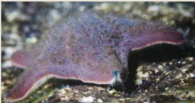
Cushion star ( Patiriella regularis ).

The Department of Conservation manages Te Paepae o Aotea (Volkner Rocks) Marine Reserve. To uphold the values of the marine reserve surveillance and enforcement is undertaken by DOC with the assistance of others. Failure to comply with the Marine Reserves Act, 1971 may result in prosecution.