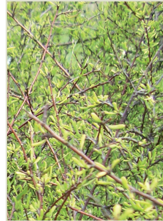
Tangled foliage of saltmarsh ribbonwood