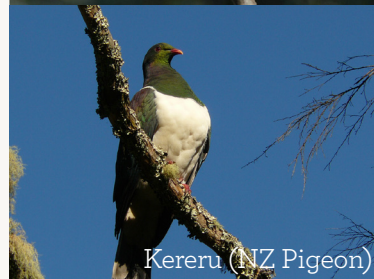
Kereru (NZ Pigeon)

This loop walk is generally an easy gradient on a grass track, with outstanding views of the Hauraki Gulf, beaches and regenerating bush. The track includes access to Ocean Beach, Snapper Bay, Calypso Bay and views over Ohinerau Bay. There are some marked Link tracks off this track which provide quicker routes to other destinations. Depending on wind direction it is always possible to find a sheltered beach for a picnic.