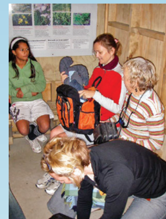
Visitors inspecting their bags.