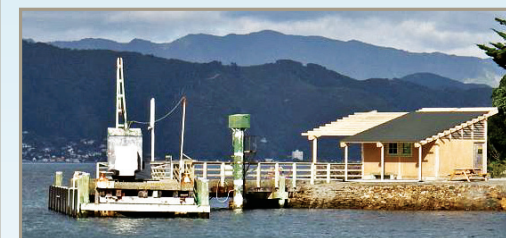
Main wharf.