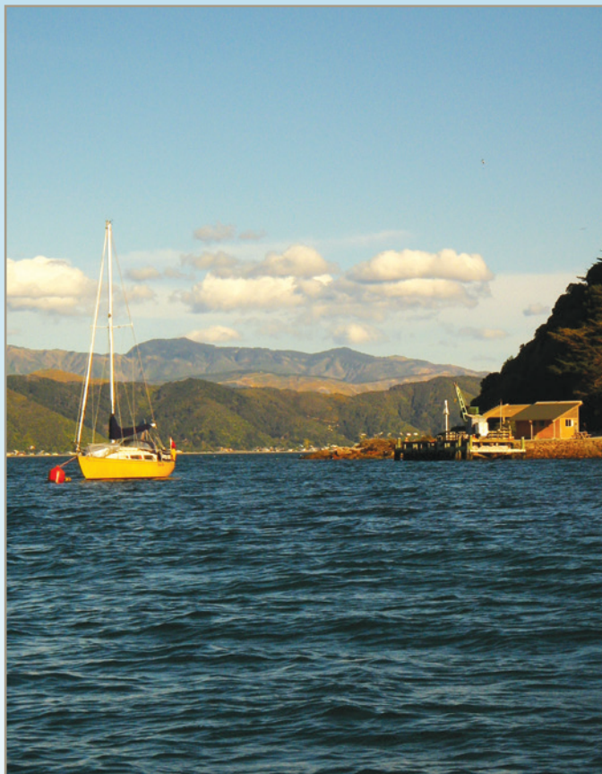
A yacht moored off Matiu/Somes Island.

Everything on the island is protected, nothing may be removed.