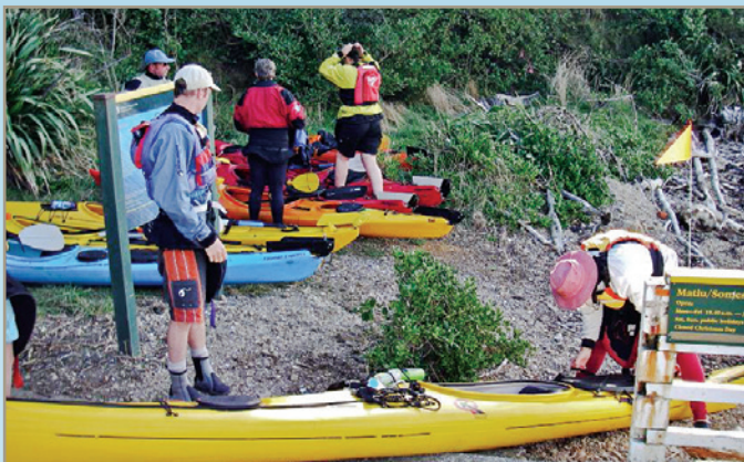
Kayakers' landing area.

The island is open daily between 8.30 a.m. and 5.00 p.m. (except Christmas Day). The island may be closed to visitors at times of extreme fire danger.