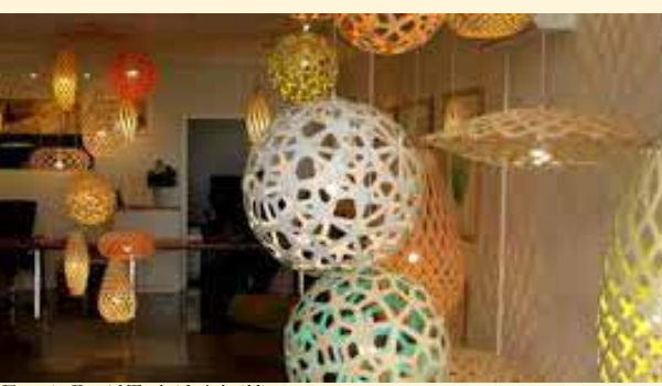
Foyer in David Trubridge's building

Cross the railway line, turn left onto Anderson Road, passing several large cold stores and offices on the right and note old freezing works on left further down the road (see later site) before turning right onto Station Road, then to the corner of Groome Place.