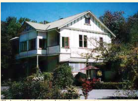
The homestead before it was destroyed by fire in 2009

On the north side of the original Bute Orchard the Garden Depot now stands. This is where the original Horton's and later Wilson's nurseries stood. These nurseries supplied many of the original fruit trees planted on the Heretaunga Plains.