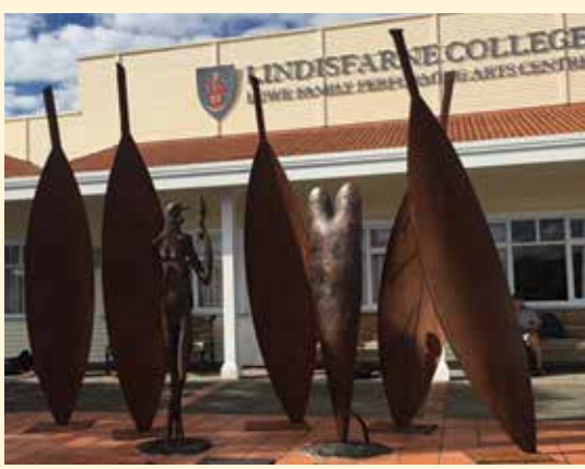
'The Performance' by Paul Dibble