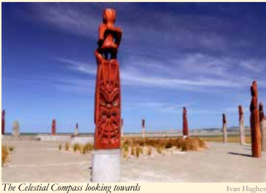
The Celestial Compass looking towards Cape Kidnappers

Celestial Compass with Maori Pou. This site is for your enjoyment with its splendid 360 degree views of Hawke's Bay and the sea, and has selfexplanatory information boards.