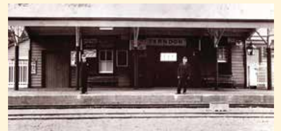
Farndon/Clive Railway Station

On this side of the Ngaruroro River the railway passed through the Waikahu area of Clive and the first mention of the name Farndon is when the new station was erected in 1874. The station was renamed the Clive Station on 20<sup>th</sup> August 1923. The station was a hive of activity in the early days as most of the local produce, as well as the output of Whakatu freezing works, was transported by rail from Farndon to Napier for export. With the increase in motor traffic the Clive Station activity was reduced dramatically. In 1968 it closed as a