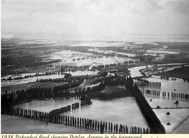
1938 Pakowhai flood showing Poplar Avenue in the foreground

This area has been a site of ancestral occupation by mana whenua, in particular the hapu of Ngati Hori, Ngati Hawea, Ngati Hinemoa and Ngati Toaharapaki, whose marae in the area are Kohupatiki, Ruahapia, Matahiwi and Waipatu.