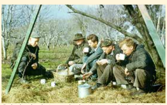
Orchard workers having a tea break c.1961

This was one of the original orcharding areas in Hawke's Bay. The following sites were significant orchards in their time.