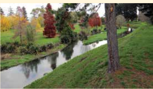
Pakowhai Country Park showing the Raupare Stream

Pakowhai Country Park (Hastings' biggest dog park) is upstream of Pakowhai Road, covering 47 acres (19.02 ha) alongside the Ngaruroro River. The Raupare Stream flows through the middle of the park along the former course of the Ngaruroro River where it once joined near the upstream boundary of the park. The former water course has been altered with Raupare Stream straightened and deepened to improve drainage. The stopbanks on either side of the park are the true right banks for both the old and new Ngaruroro River courses.