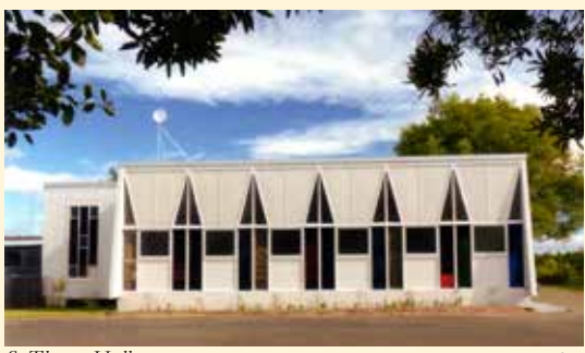
St Therese Hall