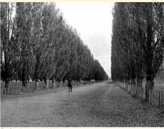
Poplar Avenue circa 1920s

It is not known when the trees were planted but in earlier days there was an avenue of large Lombardy poplar trees (known as Poplar Avenue) on either side of Pakowhai Road stretching from Elwood Road to the banks of the original course of the Ngaruroro River where the old bridge is now part of Pakowhai Country Park site. In later times the trees were removed from one side of the road but the others flourished until the danger to traffic of falling branches unfortunately meant the end to this iconic feature. The rest of these trees were removed some time in the 1960s.