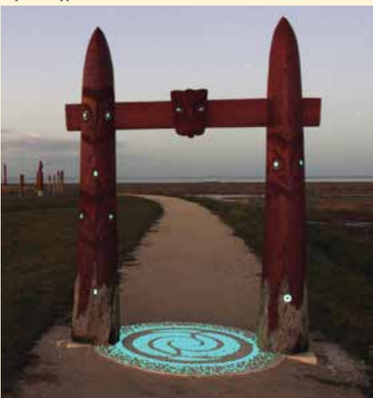
The entrance to the Celestial Compass is through the waharoa (gateway) representing the chief on the right, his two wives on the left, and the sky god above. The circular panel at its base absorbs light during the day and glows in the evening.