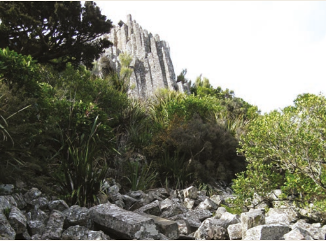
The Organ Pipes on the flanks of Mount Cargill.

Otago Peninsula was an island that became part of the mainland, thanks to the sand isthmus that is now South Dunedin. The creamy sands of the adjacent beaches come from quartz-rich sediments washed up the coast from the mouth of the Clutha River/Mata-Au.