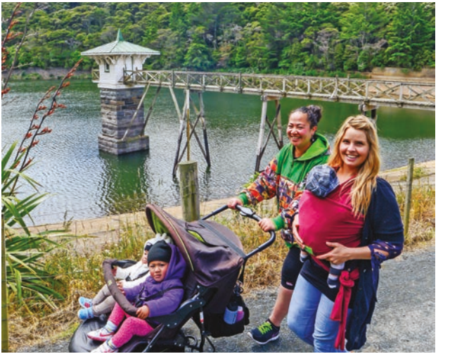
Ross Creek Reservoir.