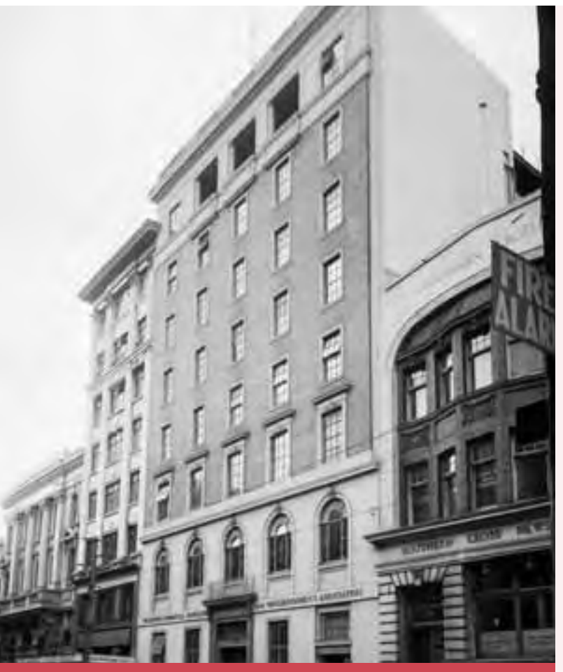
Top: A view of the United Building in the 1940s before the verandah was added.

Bottom: The tower of the MLC Building in the late 1940s.