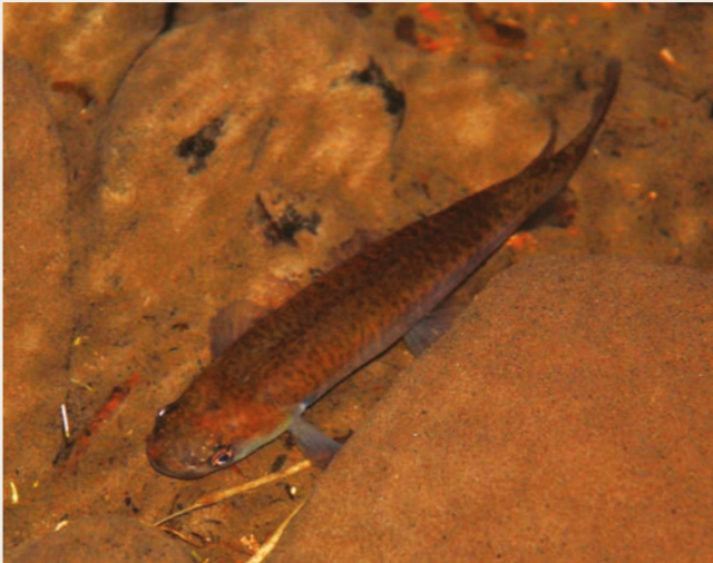
Banded kōkopu ( Galaxias fasciatus ) in Opoho Creek, beside the Big Easy MTB.

Several streams are home to some of our reclusive native kōkopu, introduced fish such the common brown trout ( Salmo trutta ), and a huge variety of freshwater invertebrates such as mayflies, stoneflies and freshwater crayfish. Brown trout and salmon are common and even spawn in the Water of Leith.