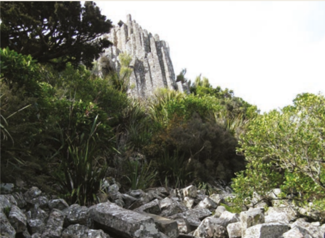
The Organ Pipes on the flanks of Mount Cargill.

Otago Peninsula was an island that became part of the mainland, thanks to the sand isthmus that is now South Dunedin. The creamy sands of the adjacent beaches come from quartz-rich sediments washed up the coast from the mouth of the Clutha River/Mata-Au.