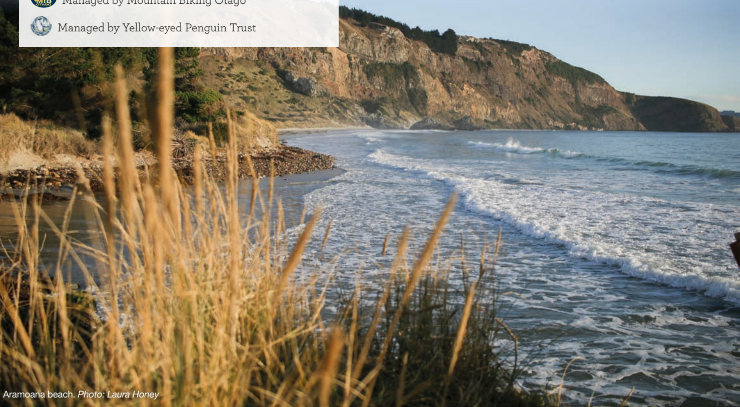
Aramoana beach.