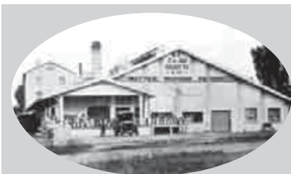
Site 33: Waharoa Butter Factory built 1921.

Today at Kaimai Cheese visitors can view the cheese-making process through huge plate-glass windows in the café while sampling the variety of cheeses made there. These included camembert, creamy blue cheese and creamy brie as well as mature cheddar. For more details see the Information Board.