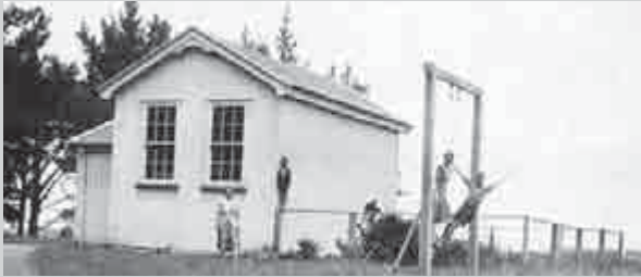
Site 8: Gordon School.

district near Te Poi. When this school closed in 1963, the old Gordon school was used as a hay barn until it was taken to the Firth Tower Museum, Matamata. The new school, left on this site when the school closed at the end of 1973, served as an office for the New Zealand Forest Service (later the Department of Conservation) from 1979, until a year or two later when it moved to an adjacent section. The school building is now used as a Community Hall.