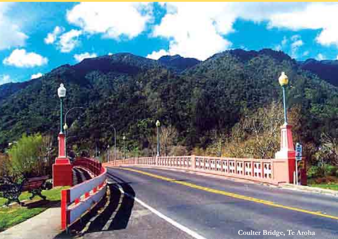
Coulter Bridge, Te Aroha