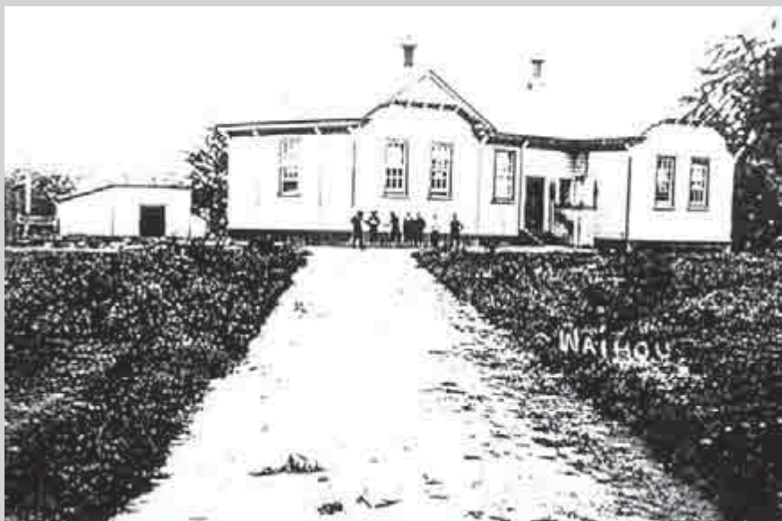
Site 54: Waihoa School.

MPDC Outstanding Trees – 17 English Oaks.