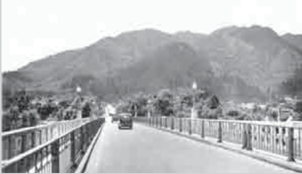
Site 58: Coulter's Bridge.

The Te Aroha Clock Tower can be seen at the end of the street and the television transmitting tower can be seen on the top of Mount Te Aroha.