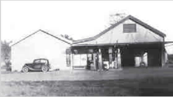
Site 53: Red Star Service Station (Russell's Garage).

Historic Places Trust Category II; MPDC Heritage site