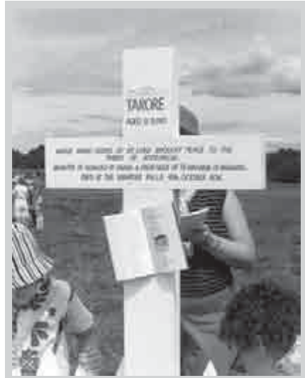
Site 37: Tarore's Grave.

The Matamata Pa is one of the Matamata-Piako District Council Heritage Waahi Tapu sites.