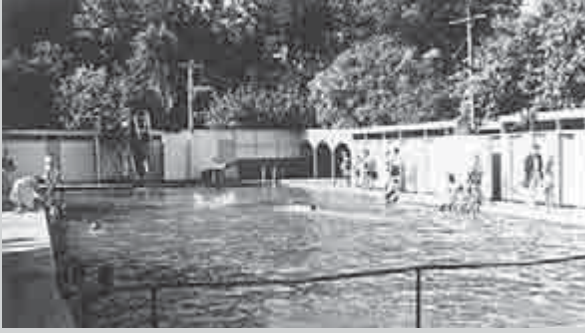
Site 21: Opal Springs.