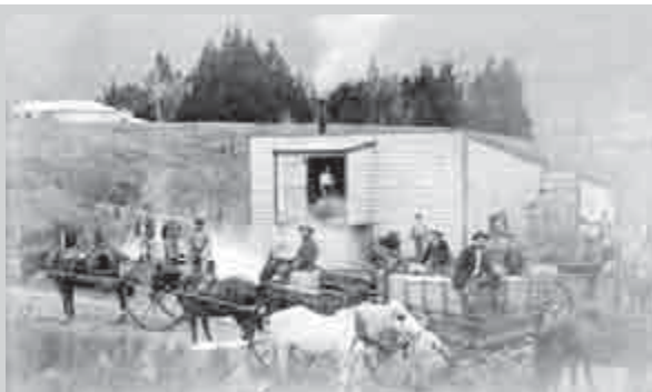
Site 6: Gordon Creamery.

300 gallons of milk per hour. Every morning farmers brought their cans of milk in waggons to be processed. The cream was then sent in a waggon drawn by two horses along Wardville Road to Waharoa railway station, where it was consigned to the butter factory at Ngaruawahia in the Waikato and later to Frankton.