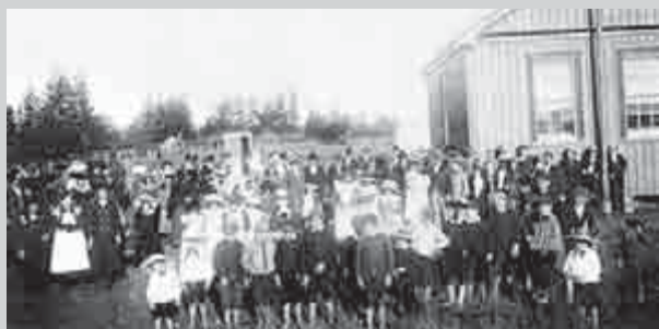
Site 51: Waitoa School official opening, 1904.

rooms on this site in Ngarua Road. In 1968 a fire destroyed the old block and new buildings were erected. In 1997 the Waitoa School Historical Society moved the original 1904 school building on to the present site and restored it for use as a community museum.