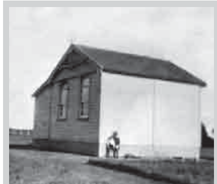
Site 19: Okauia Primary School.

was transferred to Walton School. The Okauia Hall, opened in 1961, was built on the site of the old Okauia School horse paddock.