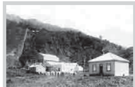
Site 3: Firth and Clarke Battery (centre) at Wairongomai, near the end of Loop Road. Fern Spar Incline at the left.

In 1884, 3000 to 4000 people were living in Wairongomai town which had a hall, 12 shops and three hotels. An old chimney standing in a paddock is all that remains today. A short distance upstream was the site of the first main battery which Firth and Clark set up in 1882, but nothing remains of it today. The large concrete bins beside the car park were part of the Piako County Council metal crushing plant, which operated from 1920 to 1927, using some of the remaining mining equipment.