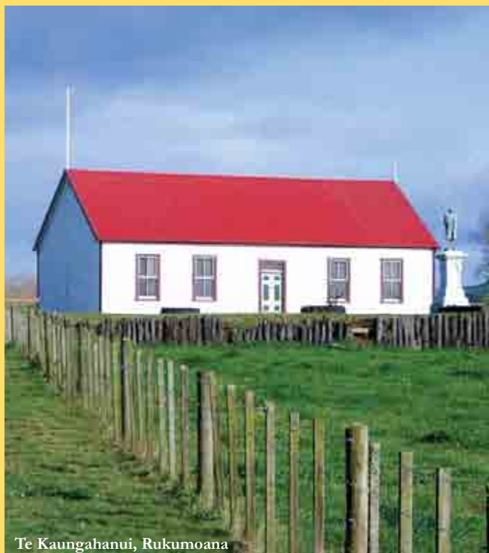
Te Kaungahanui, Rukumoana