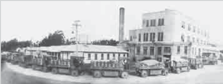
Site 50: Waitoa Milk Powder Factory showing Walker electric trucks bringing milk to the factory, 1924.

The Waitoa factory was the first in New Zealand to be supplied by tankers, which began operating in 1952. In 1981 a modernised powder plant and a new cheddar cheese factory were opened. New Zealand Milk Products, of the Fonterra Group, took over the ownership of the buildings and site in 2001.