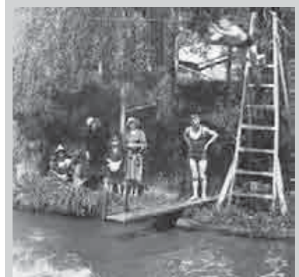
Site 20: Crystal Springs.

swimming pool. In 1979 the name was changed to Crystal Springs Park and Motor Inn. It is now privately owned by an organisation called YWAM (Youth With A Mission) Family Ministries NZ. See information Board at entrance.