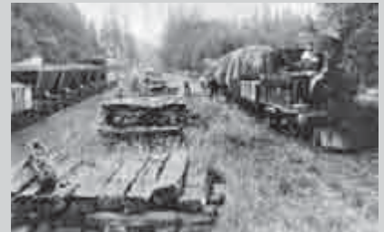
Site 47: Murray Oaks.