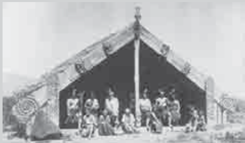
Site 27: Tamihana's Meeting House.

mill stones were brought up the River Waihou and carted to the Waitoa River to be used in the mill. Wheat was grown on the farms, ground at the mill and the flour carted over a road to the Waihou River and sent to the Auckland markets. A large meeting house (Whare Runanga) was built here also. This site is also on the Council protected list.