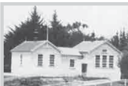
Site 42: The old Walton School.

Okauia (near Matamata) and Wharepaina (south of Rotorua) were transferred to Walton and refurbished there.