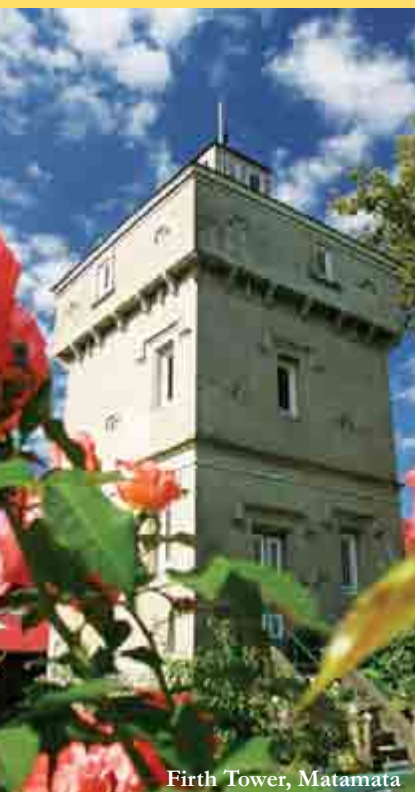
Firth Tower, Matamata