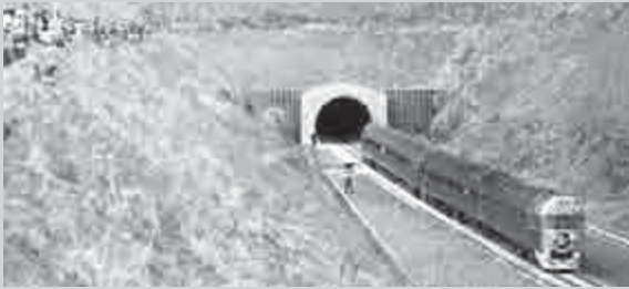
Site 10: Kaimai Tunnel.