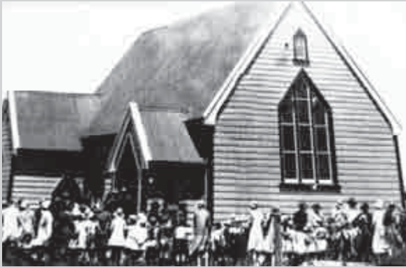
Site 57: Waihou Historical Pioneer Church. The opening by Sir Charles Ferguson.

Historic Places Trust Category II; MPDC Heritage Site. See information board inside the church gates for full details.