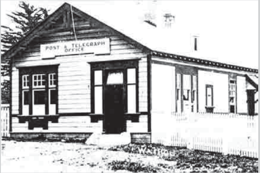
Site 56: Waihou Post Office.