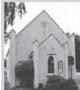
Site 30: St David's Church, Waharoa.

A bi-monthly service conducted by the Presbyterians is held now and the