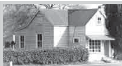
Site 41: Walton Creamery.

Historic Places Trust Category II; MPDC Heritage site.