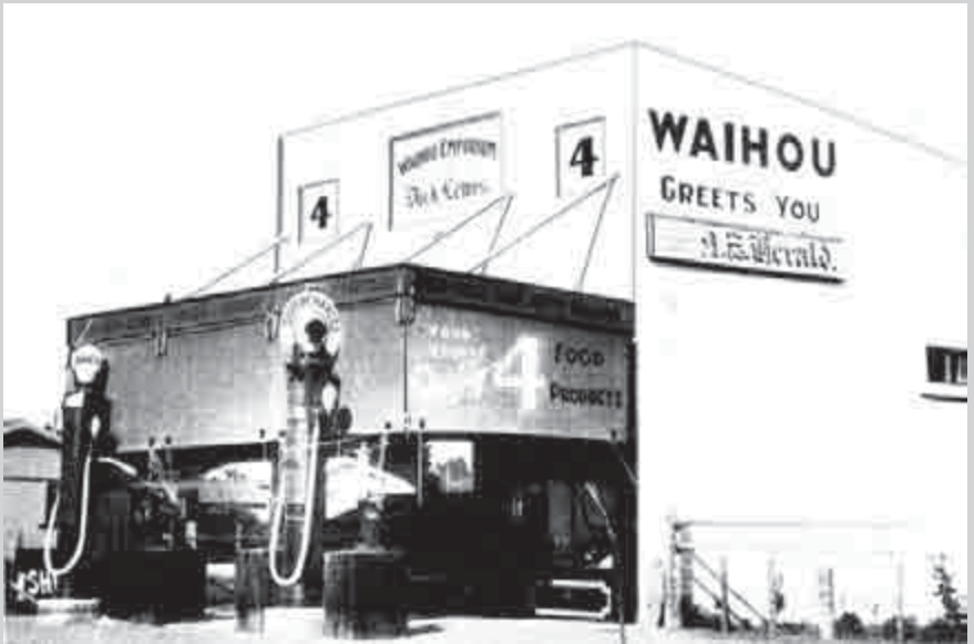
Site 55: Dick Lewis' Emporium.

Historic Places Trust Category II; MPDC Heritage Site.