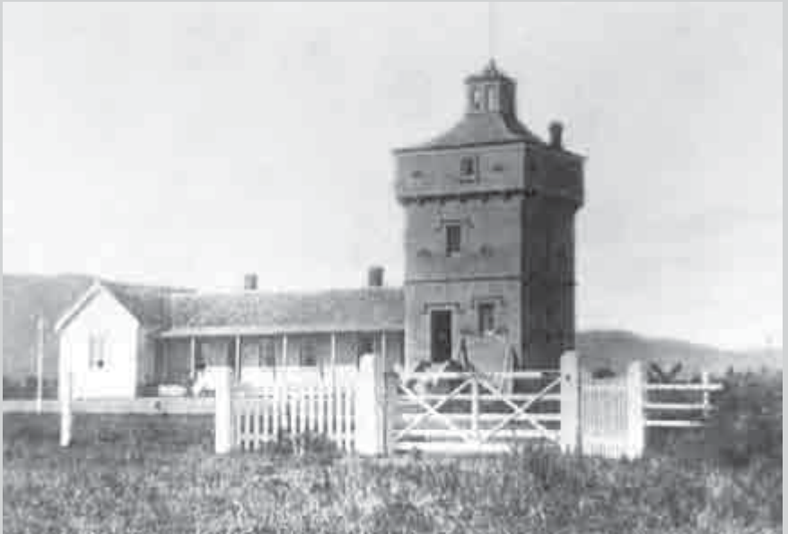
Site 23: Firth Homestead and Tower, 1884.

Public toilets here. For further details about the museum see the brochure available at the museum office or at the Matamata i-SITE in the town of Matamata. (3.9km)