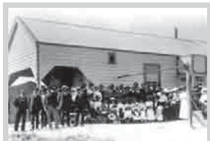
Site 15: Opening of Okauia Creamery, 1909.