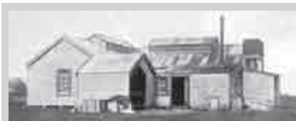
Site 32: Firth's Butter and Cheese Factory at Waharoa built 1886.

production in September 2004. Its Colby, Harvarti and Edam cheeses have scored some top prizes in the NZ Cheese Awards. They provide the home market and are exported overseas to Australia, Asia, Russia, the Middle East, the United Kingdom and Latin America. For more details see the Information Board.